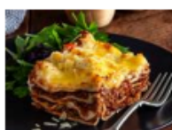
Beef 6x270g $25 3kg $39.95