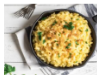
Macaroni Cheese $25