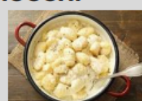
Gnocchi 1kg $12