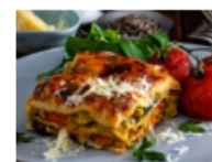
Pumpkin, Spinach & Feta $27