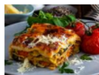
Gluten Free Vegetable $30