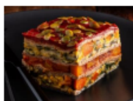
Gluten Free Vegan Lasagne $30