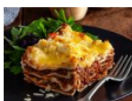
Gluten Free Beef $30