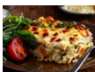
Smoked Chicken $30